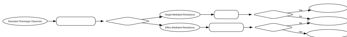
Diagram 2: Experimental Workflow for Investigating Quinolone Resistance

Click to download full resolution via product page