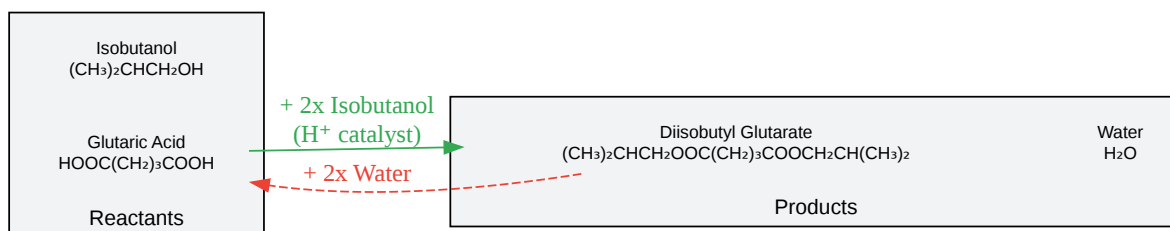
Figure 1: Synthesis of Diisobutyl Glutarate

Click to download full resolution via product page