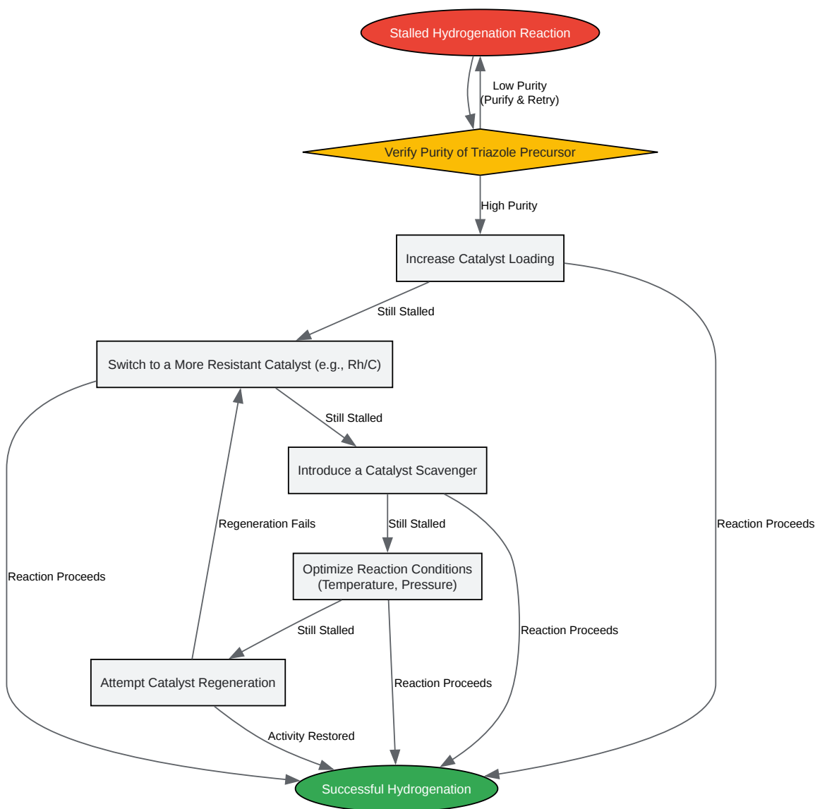
Diagram: Troubleshooting Workflow for Stalled Hydrogenation

Click to download full resolution via product page