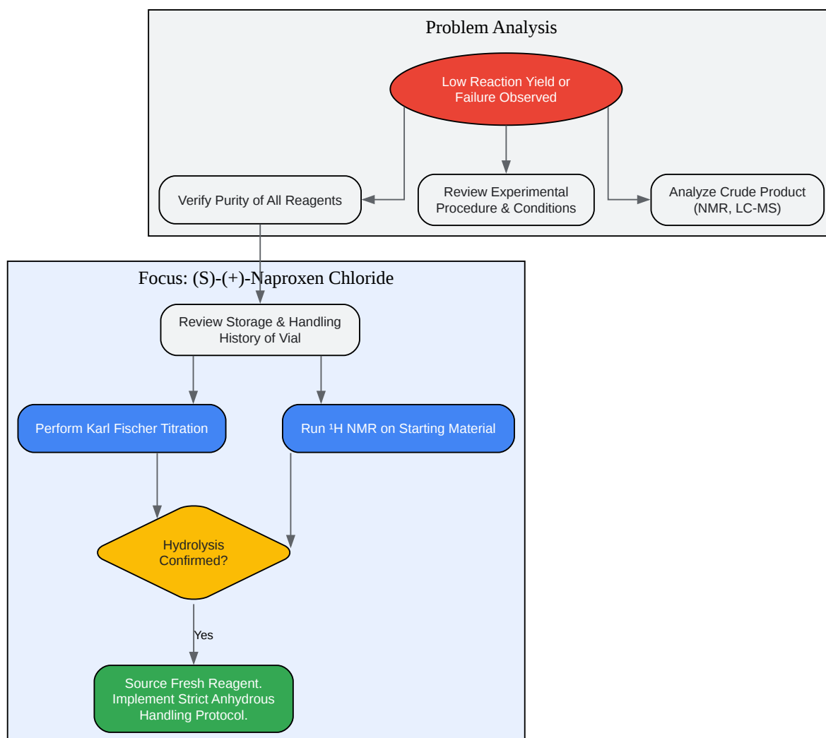
Diagram 2: Troubleshooting Workflow for Low Reaction Yield

Click to download full resolution via product page