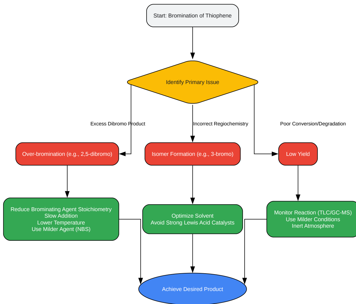
Diagram 1: Decision-Making Workflow for Troubleshooting Thiophene Bromination

Click to download full resolution via product page