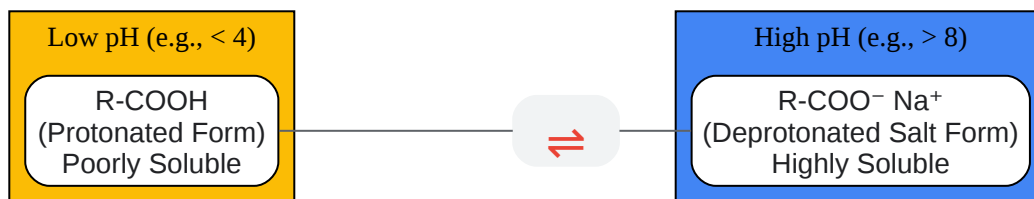
Fig 1. pH-Dependent Ionization and Solubility.

Click to download full resolution via product page