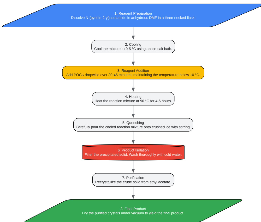
Figure 2: Experimental Workflow

Click to download full resolution via product page