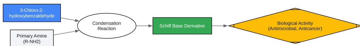
Diagram 2: Pathway to Biologically Active Schiff Bases

Click to download full resolution via product page