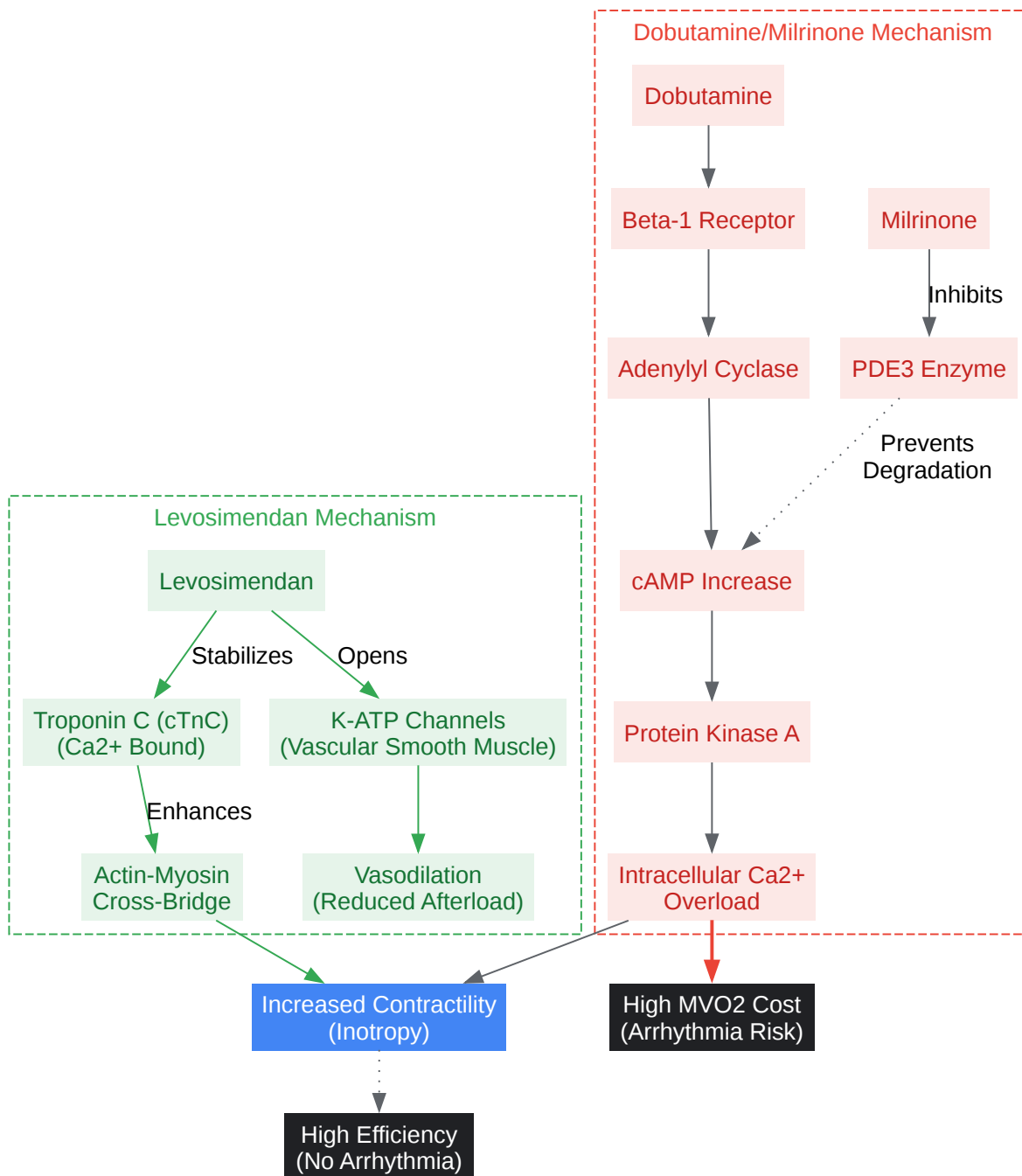
Figure 1: Calcium Sensitization vs. Calcium Mobilization Pathways

Click to download full resolution via product page