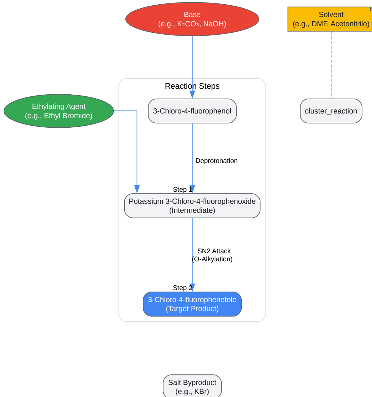
Fig 1. Williamson ether synthesis of 3-Chloro-4-fluorophenetole.

Click to download full resolution via product page