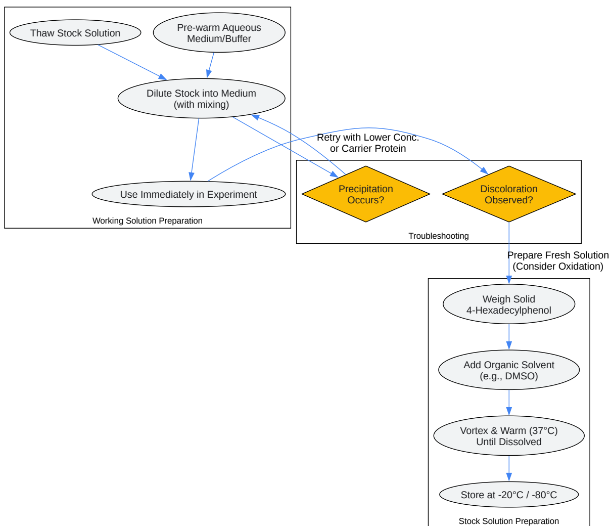
Figure 2. Workflow for Preparing Stable Solutions

Click to download full resolution via product page