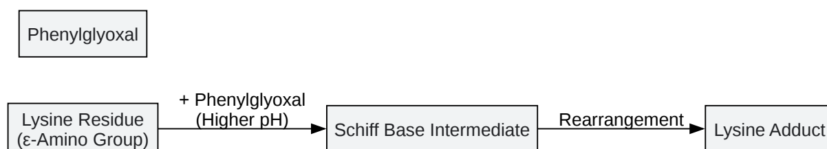
Diagram 2: Phenylglyoxal Side Reaction with Lysine

Click to download full resolution via product page