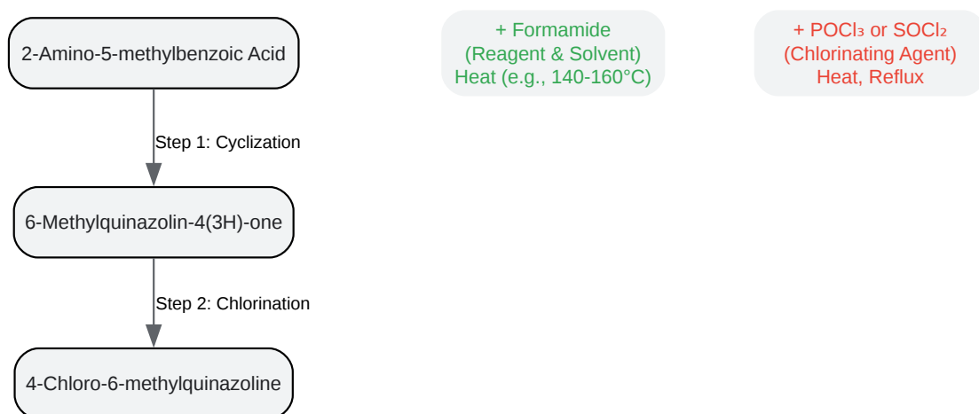
Figure 1: General Synthesis Route for 4-Chloro-6-methylquinazoline

Click to download full resolution via product page