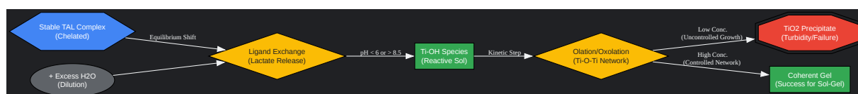
Figure 1: The Hydrolysis & Condensation Pathway[1][2]

Click to download full resolution via product page