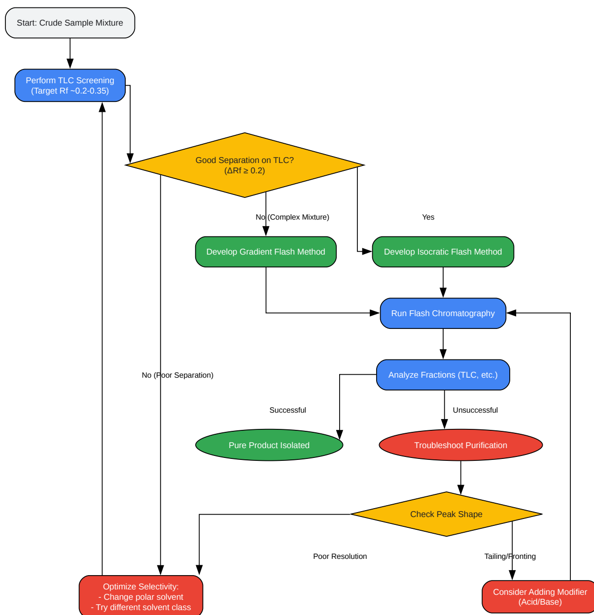
Diagram 1: Decision-Making Workflow for Solvent System Optimization

Click to download full resolution via product page