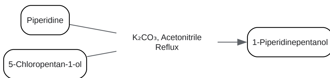
Diagram of Synthetic Pathway:

Click to download full resolution via product page