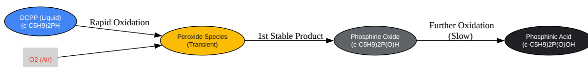
Fig 2. Oxidative degradation pathway of Dicyclopentylphosphine.

Upon exposure to air, DCPH undergoes rapid autoxidation. This reaction is exothermic and can be violent on a large scale.