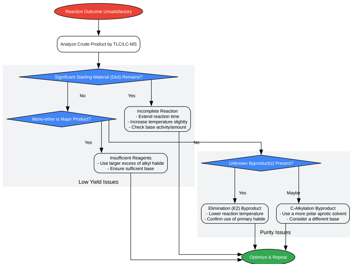
Figure 2: Troubleshooting Workflow

Click to download full resolution via product page