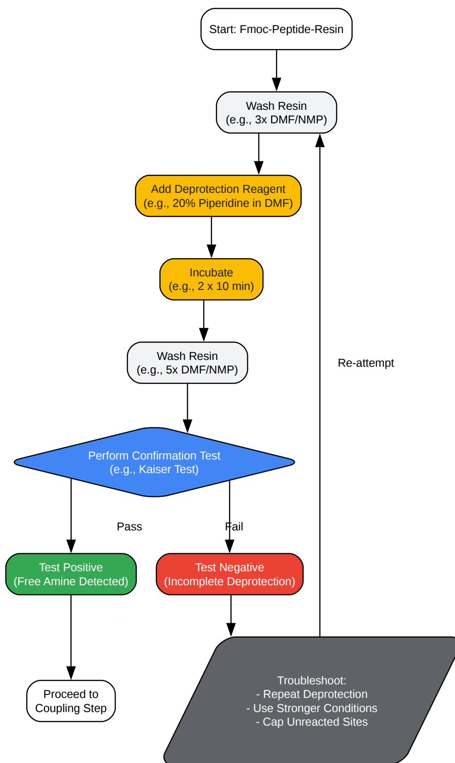
Figure 2: SPPS Deprotection &amp; Verification Workflow

Click to download full resolution via product page