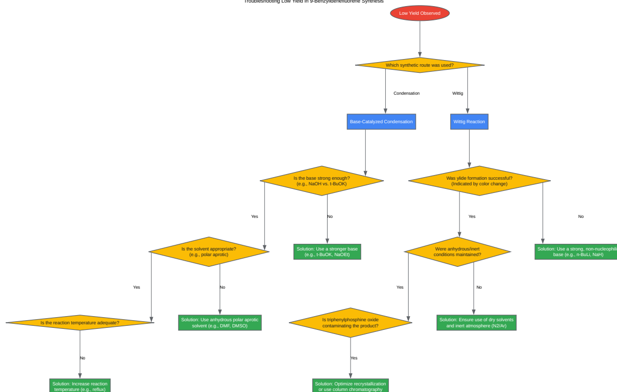
Troubleshooting Low Yield in 9-Benzylidenefluorene Synthesis