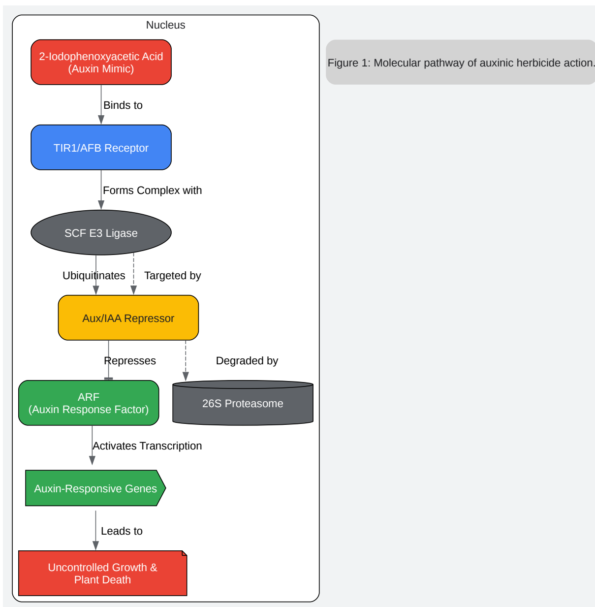
Figure 1: Molecular pathway of auxinic herbicide action.