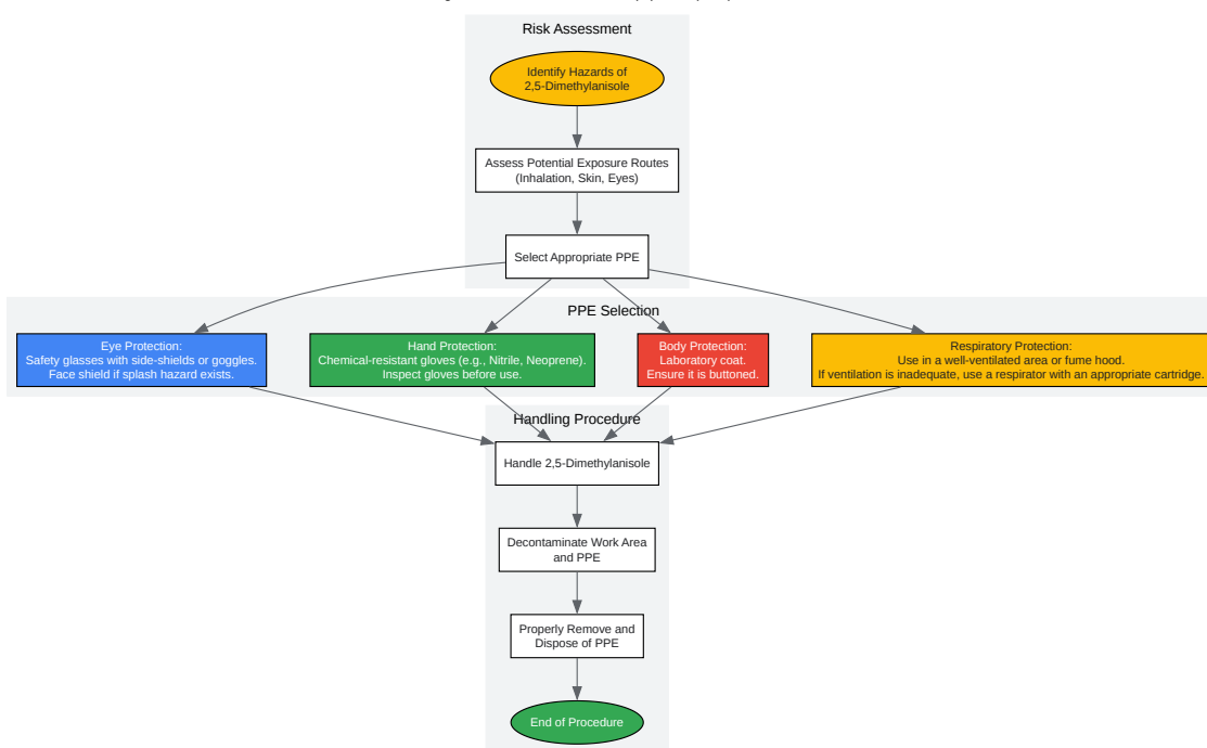
Figure 1. Personal Protective Equipment (PPE) Workflow