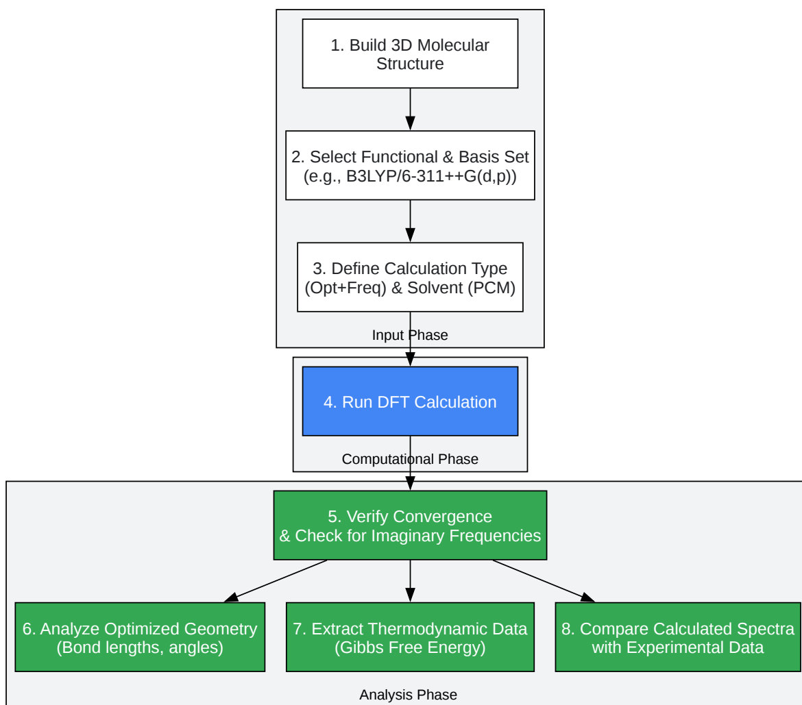
Diagram 1: Standard DFT Workflow for a Chlorinated Diketone

Click to download full resolution via product page