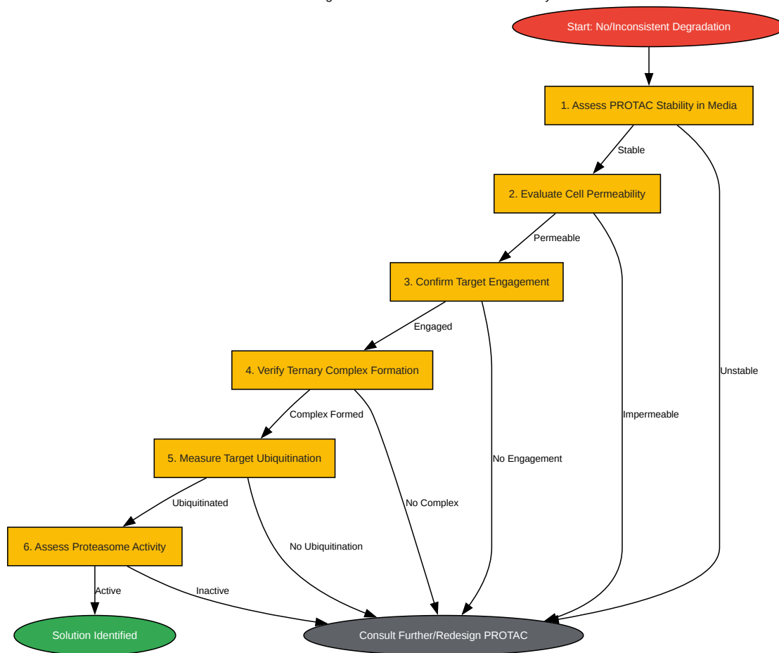
Troubleshooting Workflow for Lack of PROTAC Activity

Click to download full resolution via product page