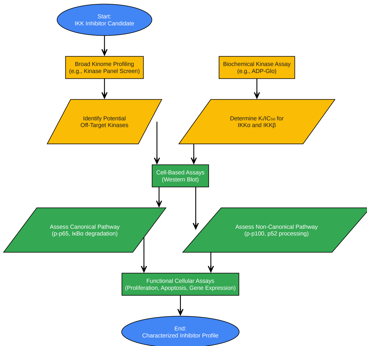
Caption: Canonical and Non-Canonical NF- \kappa B Signaling Pathways and Points of Inhibition.

Click to download full resolution via product page