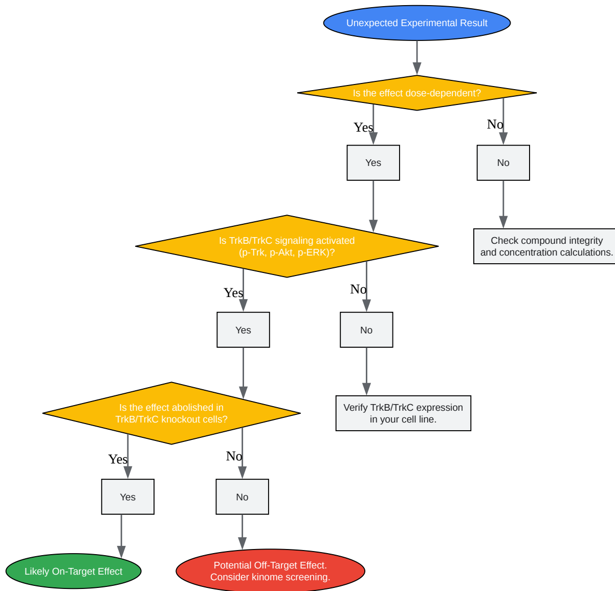
Caption: Experimental Workflow for Investigating Unexpected Phenotypes.

Click to download full resolution via product page