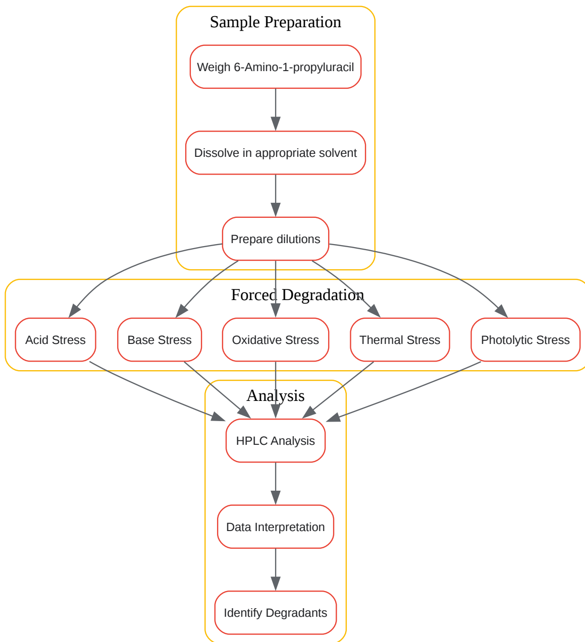
Caption: Potential degradation pathways of 6-Amino-1-propyluracil .

Click to download full resolution via product page