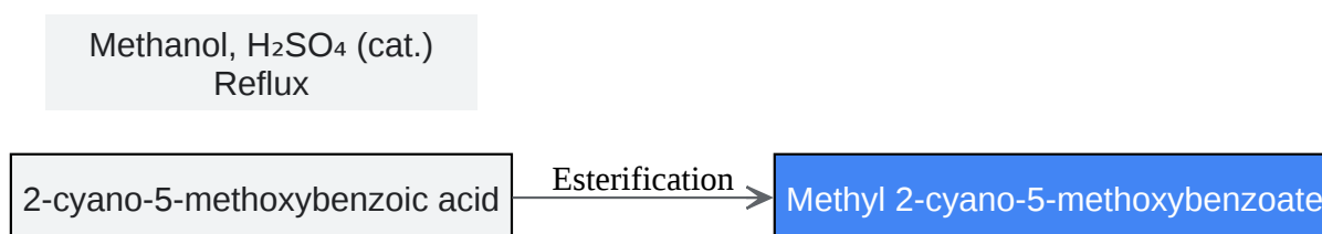
Diagram 1: Hypothetical Synthesis of Methyl 2-cyano-5-methoxybenzoate

Click to download full resolution via product page