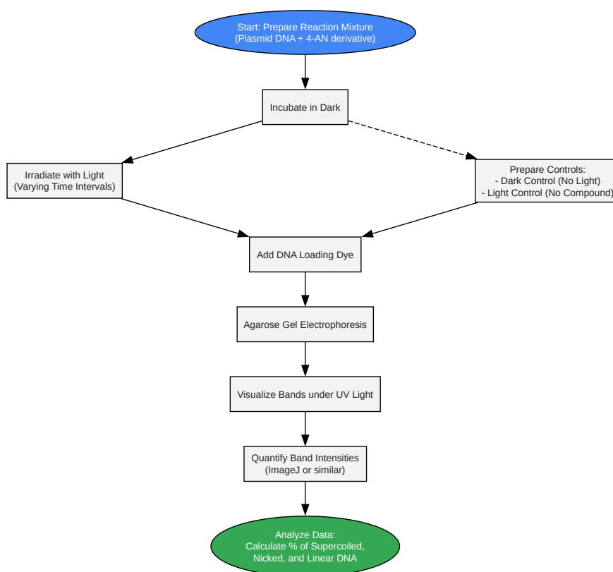
Diagram 2: Experimental Workflow for DNA Photocleavage Assay

Click to download full resolution via product page