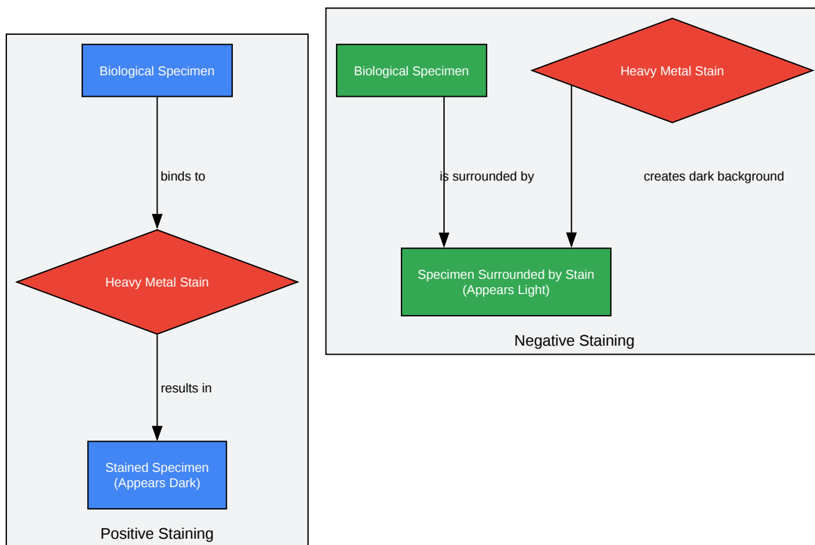
Figure 1: Comparison of Staining Mechanisms

Click to download full resolution via product page