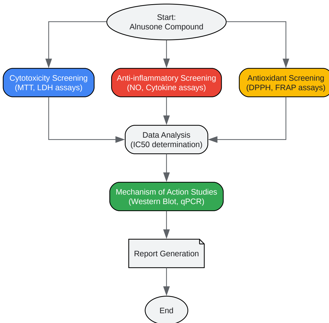
Diagram 3: General Workflow for Preliminary Biological Screening

Click to download full resolution via product page