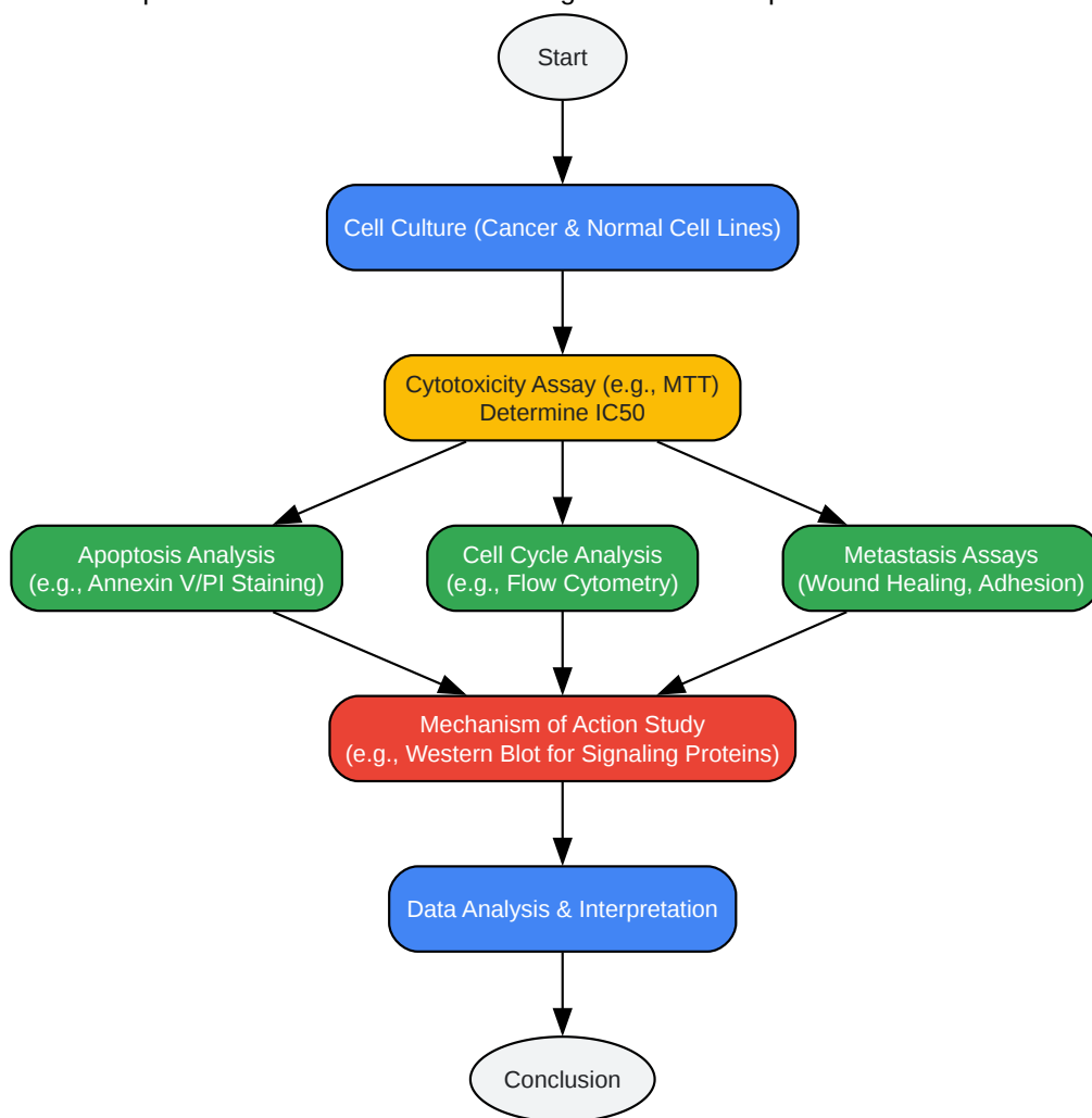
General Experimental Workflow for Assessing Anticancer Properties of Ganoderic Acid T

The following diagram outlines a typical experimental workflow for assessing the anticancer properties of Ganoderic acid T.