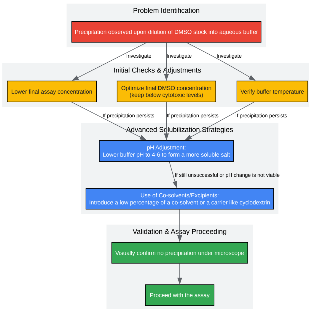
Troubleshooting Workflow for 14-Dehydrobrowniine Solubility Issues