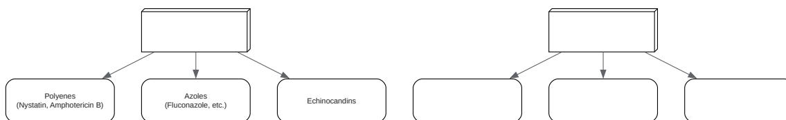
Figure 3: Antifungal Drug Pipeline

Click to download full resolution via product page