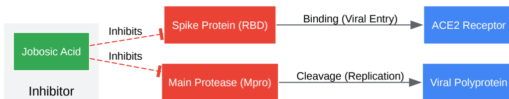
Figure 2: A simplified diagram illustrating the putative inhibitory action of Jobosic acid on SARS-CoV-2.

Click to download full resolution via product page