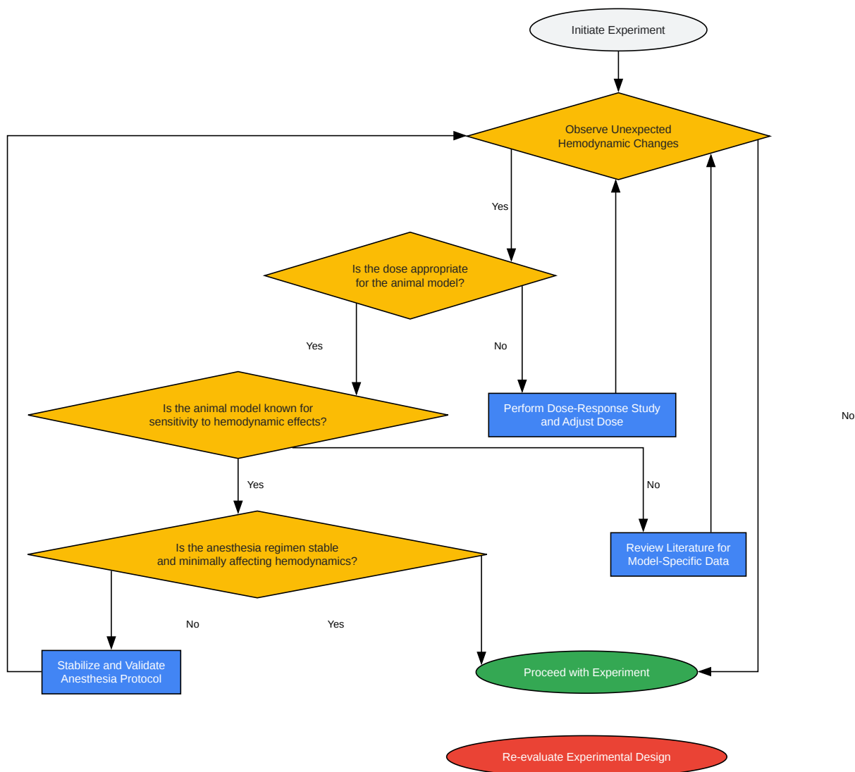
Caption: Multi-target mechanism of CP-060S leading to cardioprotection with limited hemodynamic changes.