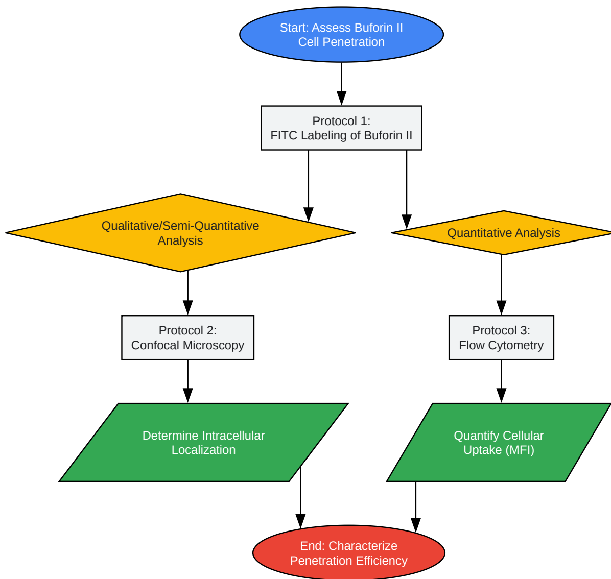
Caption: Mechanism of Buforin II cell penetration and action.

Click to download full resolution via product page