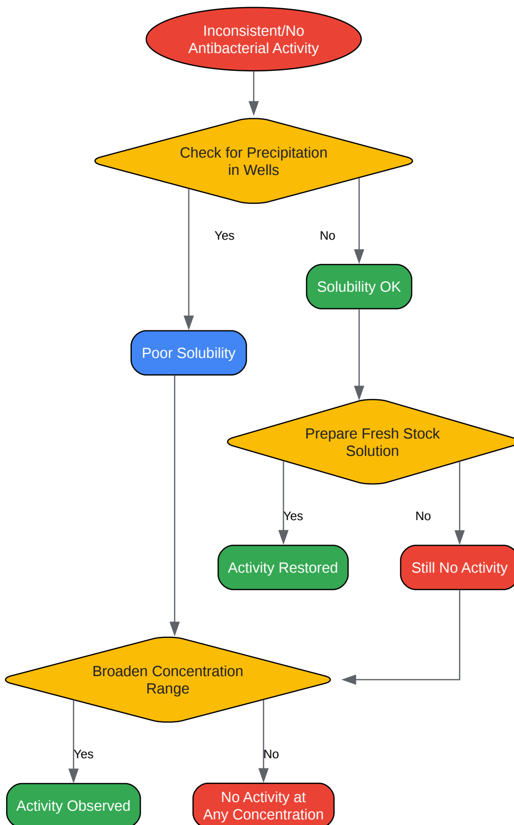
Caption: Workflow for MBC Determination.

Click to download full resolution via product page