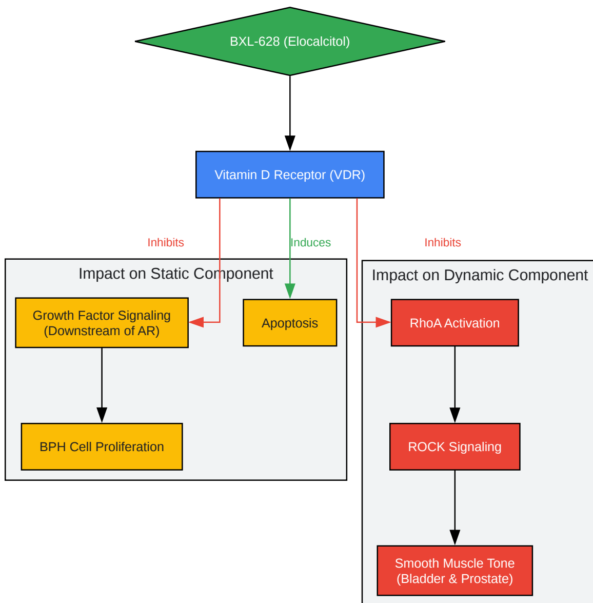
Proposed Mechanism of Action for BXL-628

Click to download full resolution via product page