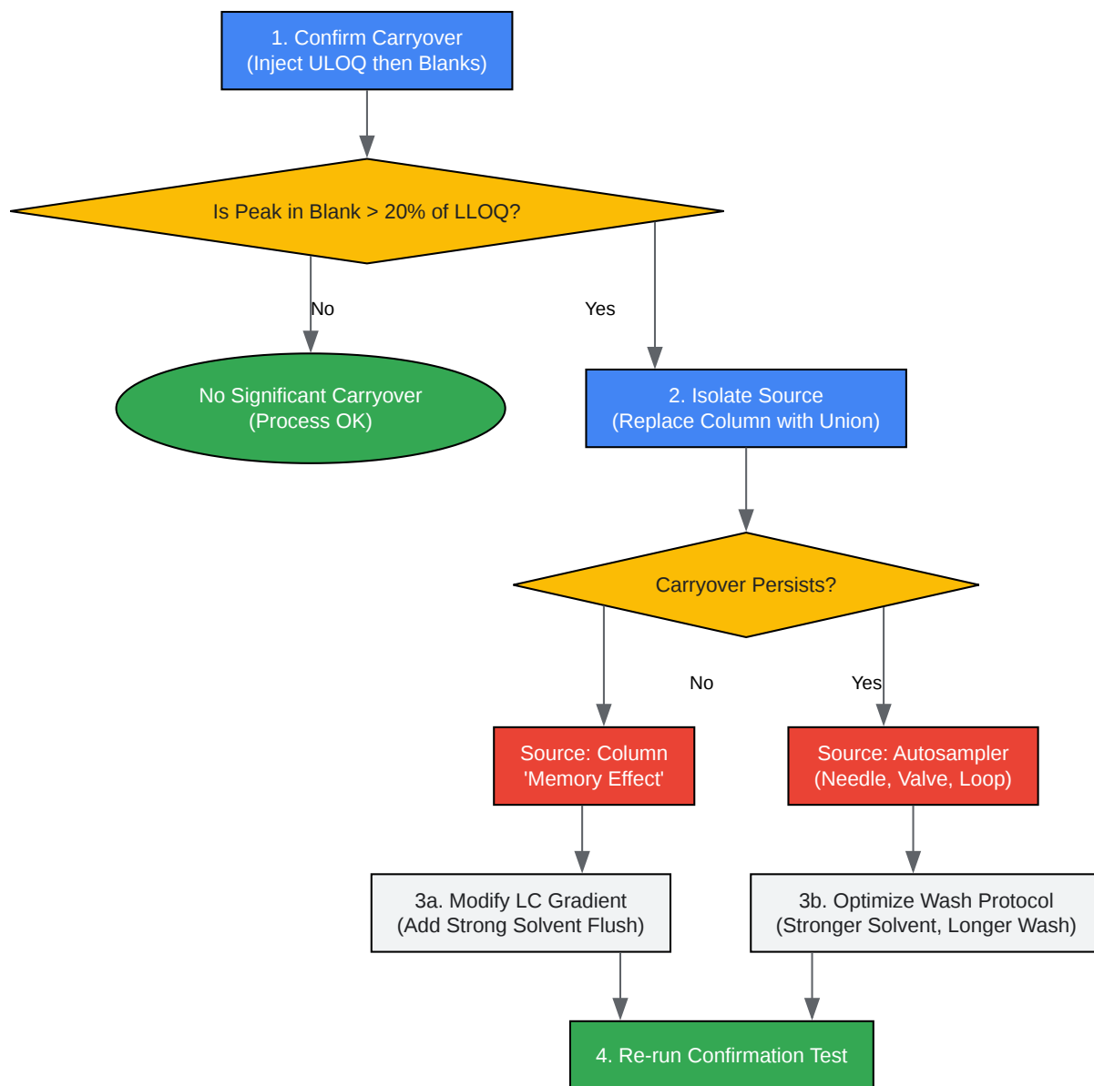
Workflow for Isolating Carryover Source