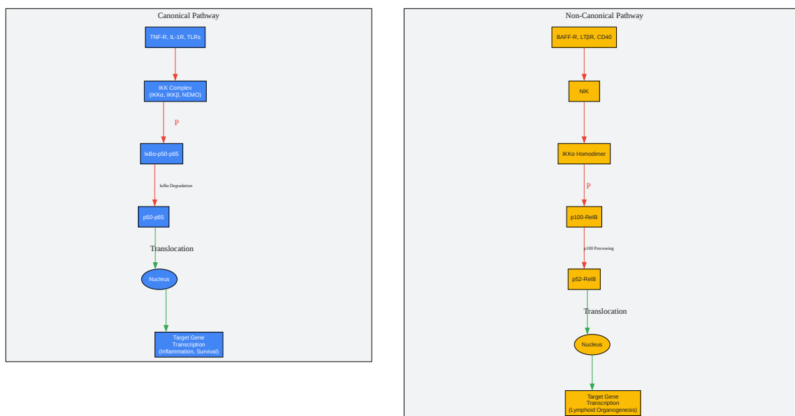
NF- \kappa B Canonical and Non-Canonical Signaling Pathways

Click to download full resolution via product page