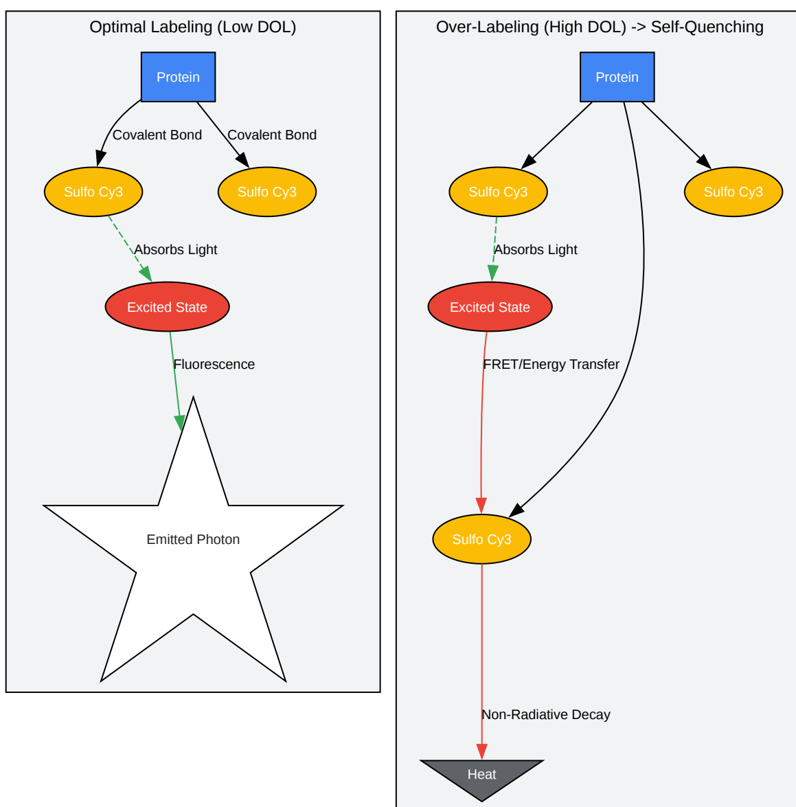
Mechanism of Sulfo Cy3 Self-Quenching