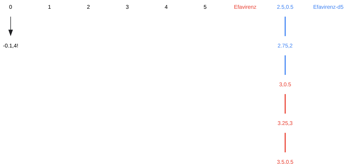
Figure 1. General experimental workflow for the quantitative analysis of Efavirenz using an internal standard.

Click to download full resolution via product page