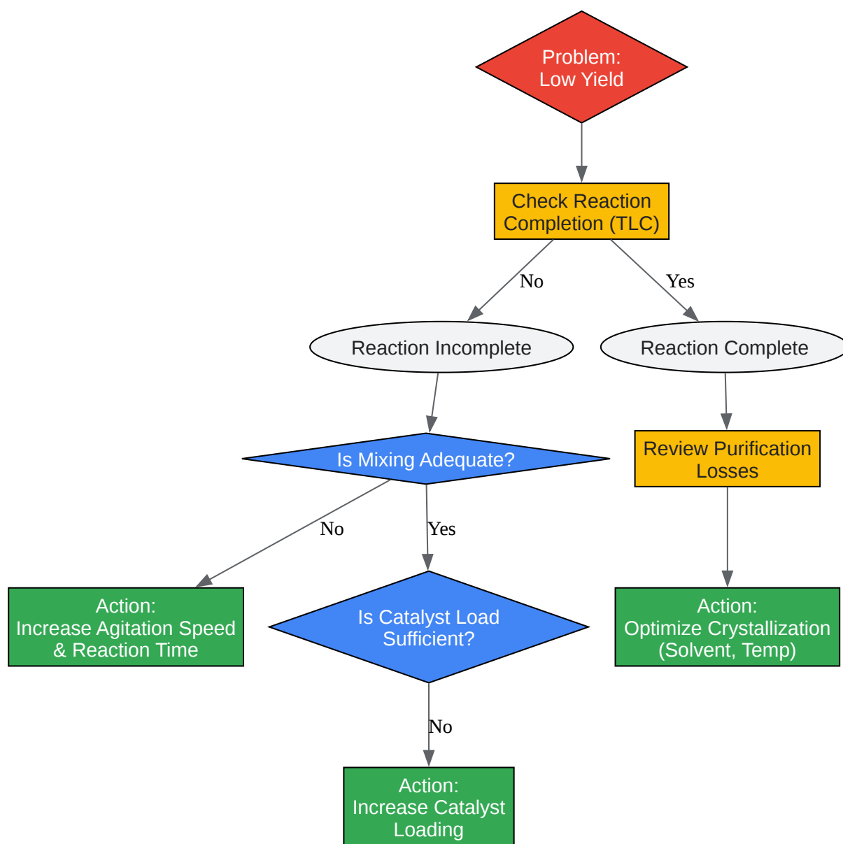
Diagram 2: Troubleshooting Low Yield

This diagram provides a logical path for troubleshooting low product yield.