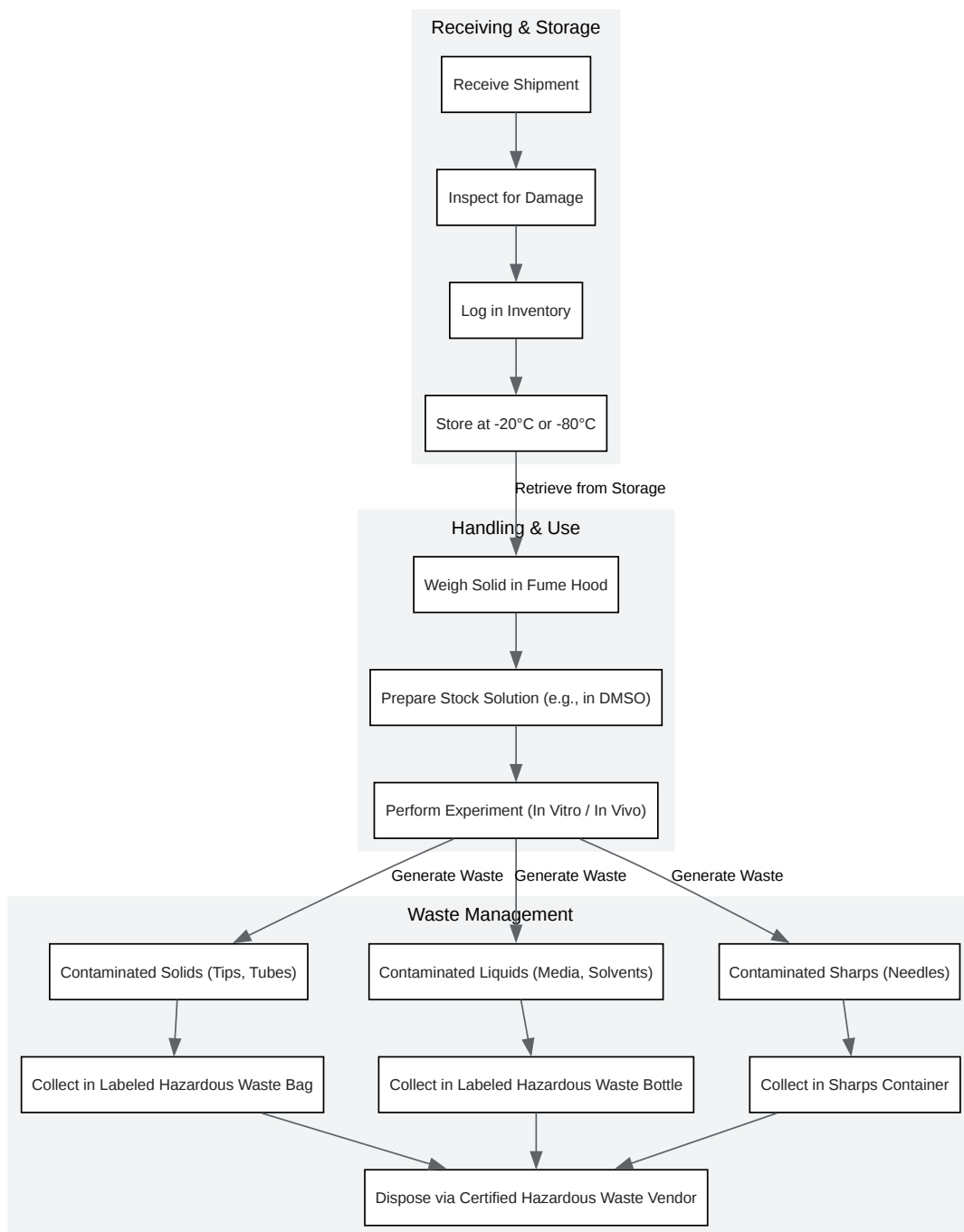
Figure 1. Operational Workflow for AZ'3137