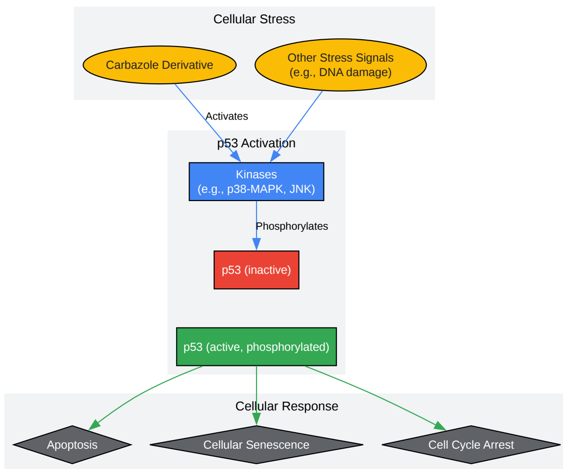
Representative p53 Signaling Pathway Activated by Carbazole Derivatives

Click to download full resolution via product page