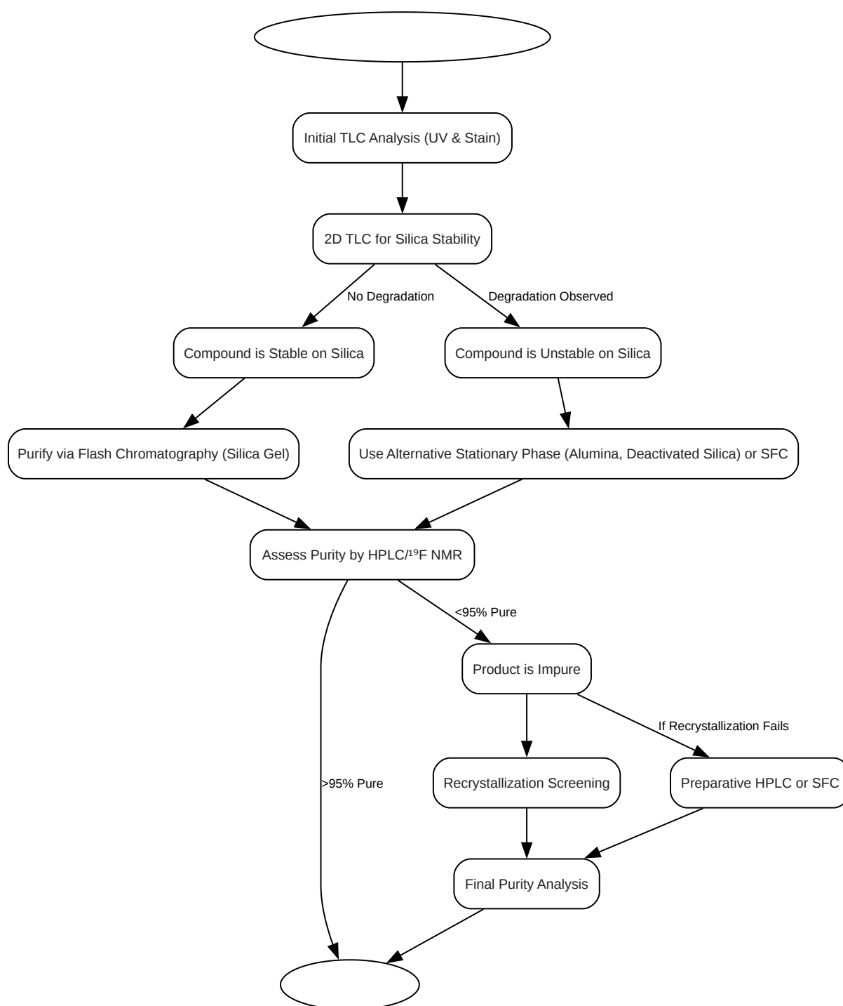
Diagram 2: General Purification Strategy for a Novel OCF 3 Compound