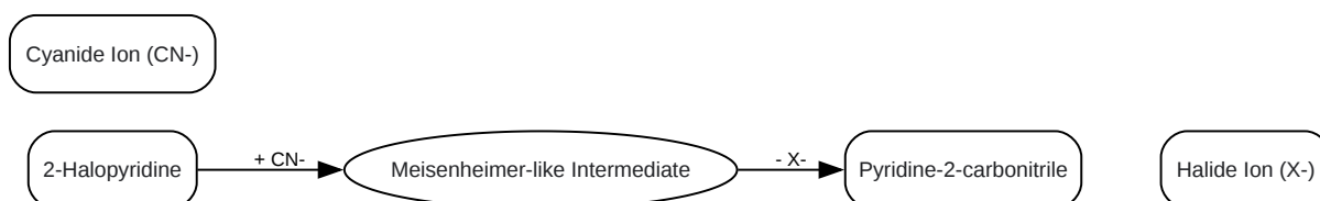
Diagram: Cyanation of 2-Halopyridine Mechanism

Click to download full resolution via product page