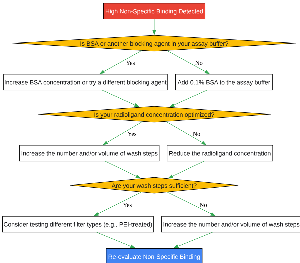
Diagram 2: Troubleshooting High Non-Specific Binding

Click to download full resolution via product page