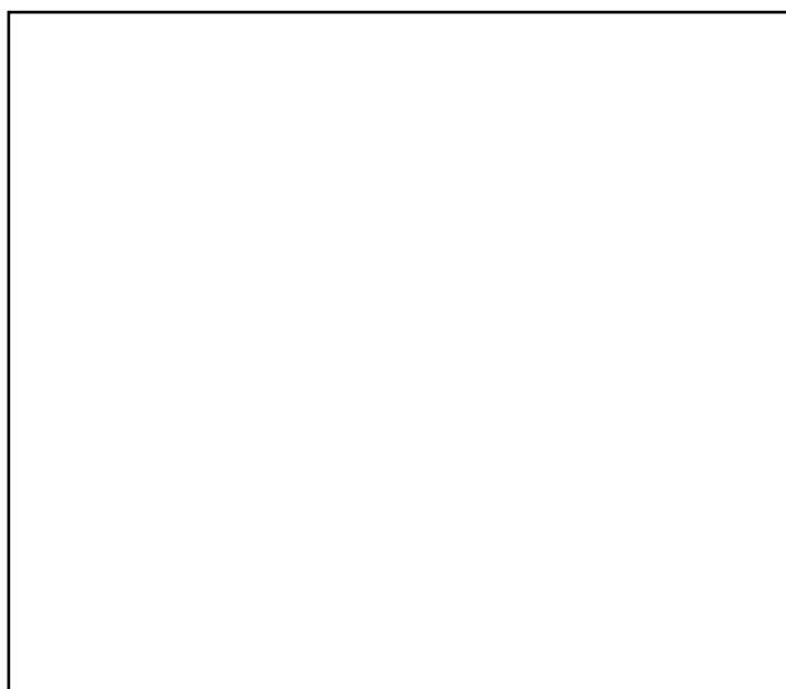
Figure 1: Structure of 5-Bromo-N,N,4-trimethylpyridin-2-amine

This guide will systematically deconstruct the ^{13}\text{C} NMR analysis of this molecule, providing not just a protocol, but the scientific rationale behind each step, ensuring a self-validating and trustworthy structural assignment.